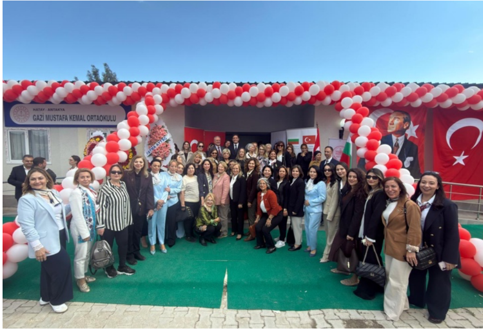
The opening of TAUW's first school building in Hatay's Serinyol neighbourhood on 22 April 2026.