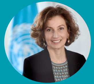
Audrey Azoulay, Director-General of UNESCO

"On this day, let us remember that Indigenous Peoples are actors of change, guardians of natural resources and carriers of unique worldviews, knowledge and skills. We must protect their traditions and ways of life - while respecting their rights."