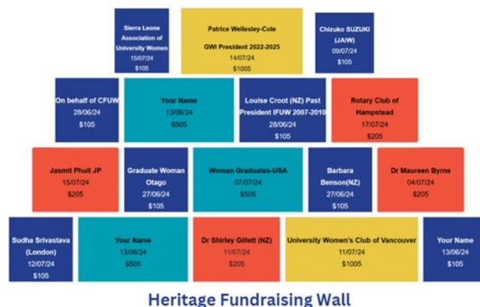
Heritage Fundraising Wall