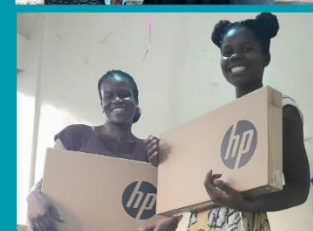
Teachers for Rural Futures Student Teachers

Join a GWI affiliate today at www.graduatewomen.org