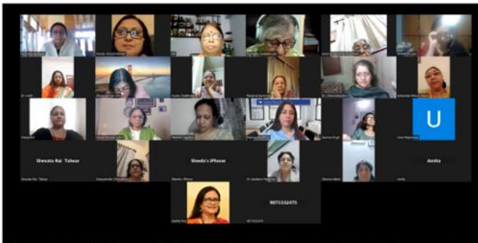
Screenshot of the "Women in Humanitarian Crises" event, see Member News section