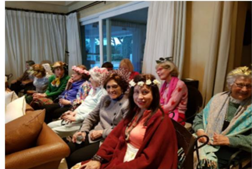
"Poetic recital Women authors in love poetry" MARPOÉTICA 2023