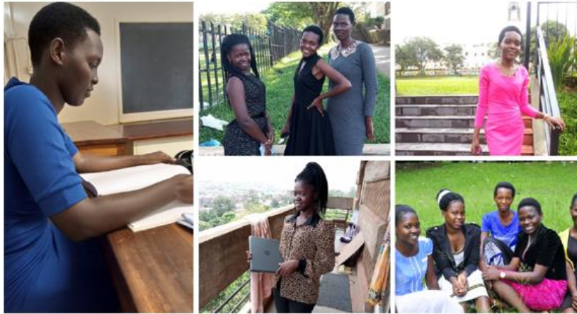
Teachers for Rural Futures Students