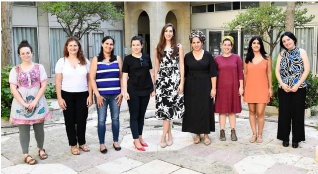
Nine women have received scholarships from the Jerusalem branch.

“The AUW, in keeping with one of our main aims of promoting and encouraging the continuing education of girls and women, has been operating a very successful Scholarship Fund for many years. The Jerusalem Branch of IAUW has awarded over 600 scholarships in the last 50 years to doctoral women students at the Hebrew University of Jerusalem. These grants have been conferred at an annual awards event. Last year, due to the corona pandemic, we were unable to hold an awards ceremony, but we were able to grant 10 scholarships to doctoral students. This year, on July 6, 2021, at a very gratifying event, we again awarded 9 scholarships of 6,000 NIS each to women doctoral students, and heard very interesting resumes about their research.