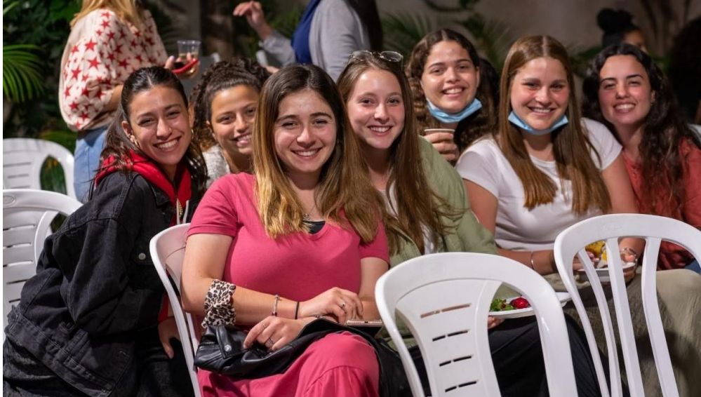
Out of the 19 scholarships given to the Tel Aviv branch, these seven women have received the scholarship awards from the Tel Aviv branch

have been removed from their homes by court order and are living and studying in these institutions. Members of the Branch mentor and help these young women in various ways. For the past three years the Branch has been awarding scholarships to some of these young women for their continued education in institutes of higher learning. This year they awarded 19 scholarships of 6,000 NIS each.