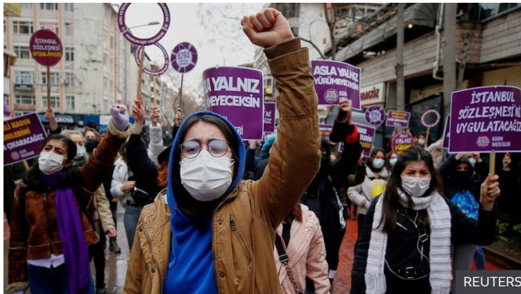
Women rally in Ankara, Turkey against Turkey's withdrawal from the Istanbul Convention.