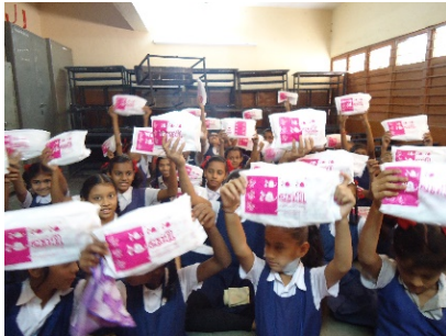
IFUWA Vadadora and Vatsalya Foundation work to promote women and girls’ access to menstrual hygiene.

During the Indian festival of Navratri, people worship the courage and power of Goddess Durga as a symbol of every woman’s strength and ability to change the world. On this occasion, IFUWA Vadadora and Vatsalya Foundation organised a nine-day long, online Navratri celebration of women’s empowerment, highlighting the importance of menstrual hygiene for all women and girls. GWI is inspired by both organisations’ crucial contribution to women and girls’ safe access to menstrual hygiene management and reminds that, despite being a universal phenomenon for women, menstruation is still too often stigmatized and treated as a taboo, which is linked to high rates of Menstrual Hygiene Insecurity. Learn more about this successful event HERE .