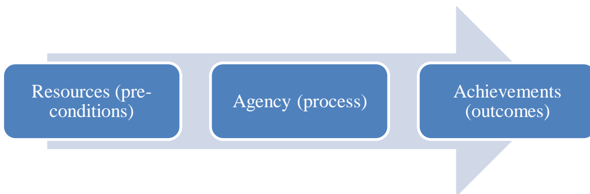
Figure.1 Three Dimensional Model by Kabeer

Women empowerment is considered as a process that takes place over time, making women agents who formulate choices, control resources and make strategic life choices (Lee-Rife, 2010). She emphasised on the strategic life choices (choice of livelihood, marital decision and child bearing decision) which are considered as first-order choices and how these impact second-order choice (inculcating values in children, daily household decision making and managing well being of the family) that are less consequential.