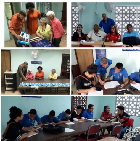
AMUP cordially provided GWI with pictures of the training programmes.

The Asociación de Mujeres Universitarias de Panamá (AMUP) recently formed an alliance and signed an agreement with the Hazme Brillar Foundation, the Carlos Slim Foundation, the National Institute of Vocational Training of Panama and the Support Center for Battered Women of Panama. As part of the agreement, AMUP received 15 Huawei tablets and a multiple-charger case from the cited organisations for the AMUP Culture Center. The tablets will enable AMUP to provide virtual training programmes through modules to the Center's users and give them an opportunity to prepare as they enter the workforce. Indeed, on 25 November 2019, 12 motivated candidates and representatives of all sponsors initiated the training programme. GWI congratulates AMUP on the successful conclusion of the aforementioned alliances and agreements and wishes success to the virtual training programmes.