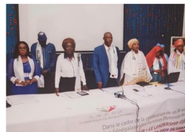
ASFDU celebrated its 30th anniversary in November 2019.