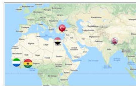
Current 2018 NFAs with BRPID projects.