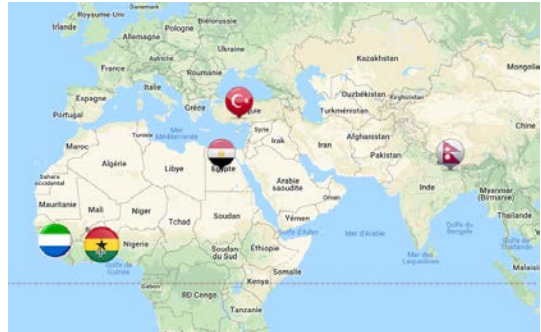
Current 2018 NFAs with BRPID projects.