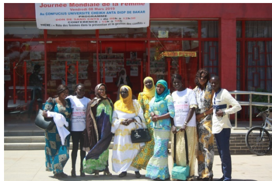
ASFDU International Women's Day Activity Participants

The Senegalese Association of University Women (ASFDU) holds multiple awareness raising event to showcase the importance of women’s education and empowerment. On International Women’s Day, ASFDU organized a day long celebration at the Confucius University Cheikh Anta Diop in Dakar, Senegal. In the morning, members, friends and followers of ASFDU, along with members of the university community, were invited to participate in a blood drive, before attending in the afternoon a conference on women’s role in peace building and conflict management. During this conference, participants discussed and reflected on the importance of women’s empowerment and the crucial role that women and girls can play in the building of a more peaceful, equal and sustainable future. GWI congratulates and thanks ASFDU for these notable and successful events.