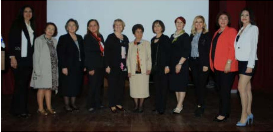
TAUW Board Members, former presidents and award winners during the Turkish Association of University Women (TAUW) 12 th Leader Women Awards