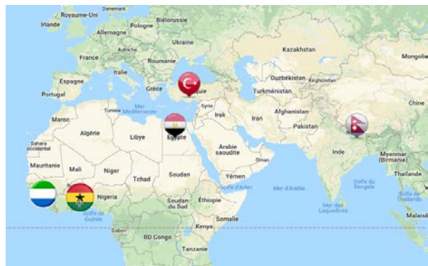
Current 2018 NFAs with BRPID projects.