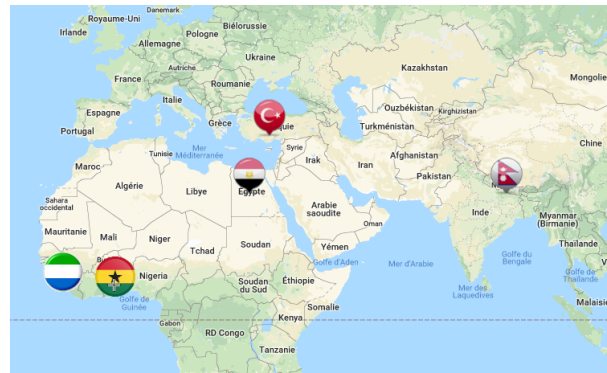
Current 2018 NFAs with BRPID projects.