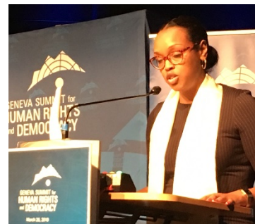
Nimco Ali delivering her acceptance speech