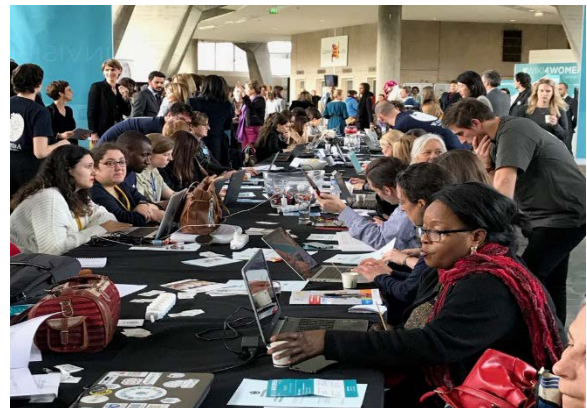
Wiki4Women - Contributors training