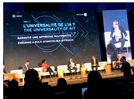
Plenary Session: Universality of AI?