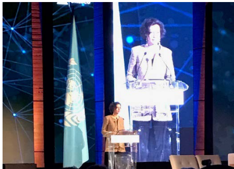
Opening speech from Ms Azoulay, UNESCO Director -General