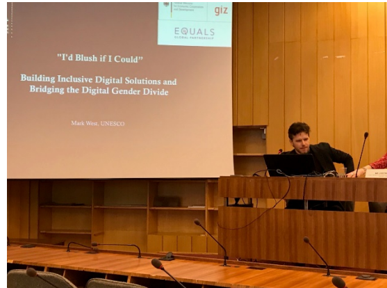
Workshop « e skills 4 girls » / Inclusive digital solutions