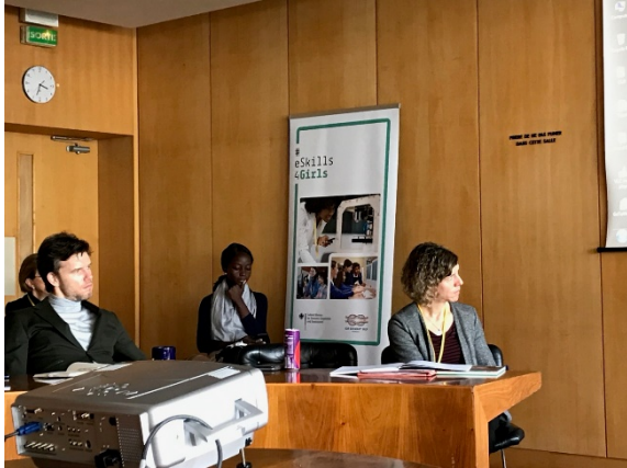
Workshop « e skills 4 girls »/ will AI promote equity and gender equality?