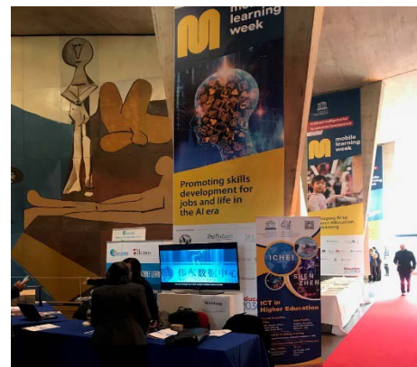
MLW poster(jobs opportunities)