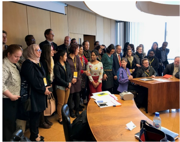
Strategy lab 5: Using AI to support teachers and teacher development