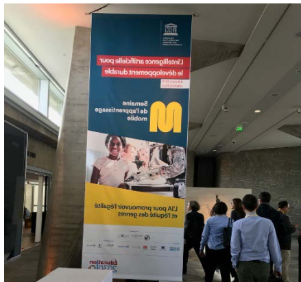
MLW poster (gender equality)