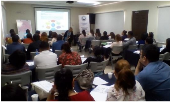
Course being held by AMUS on the prevention of violence against young girls, children and adolescents.