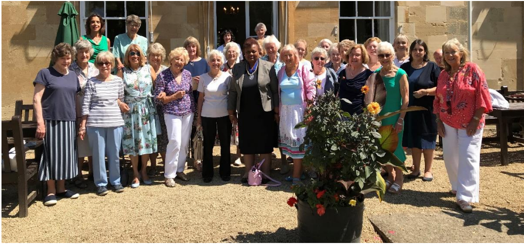
British Federation delegates pictured on 22 July at Denman College, Oxfordshire after the 108 th Annual General Meeting where they celebrated the award of European Association of the Year 2018.