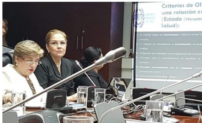
AMUS presenting before El Salvador's Legislative Assembly Commission of Deputies of Health.

Last month, Asociación de Mujeres Universitarias de El Salvador (AMUS) celebrated its 65 th anniversary. Alongside this milestone, they inaugurated a new training centre “AMUS El Salvador” and introduced a comprehensive training course, comprising five modules, that examines the prevention of violence against young girls, children and adolescents.