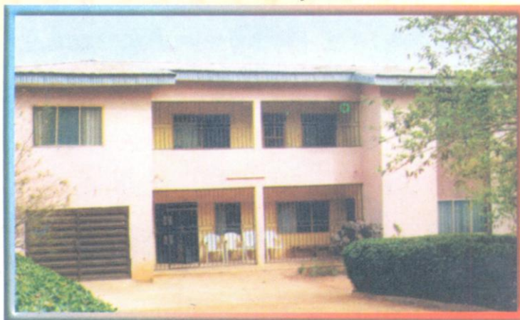
All Saints Parsonage by the Women.