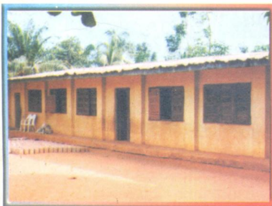
Hall / Nursery School built by the women