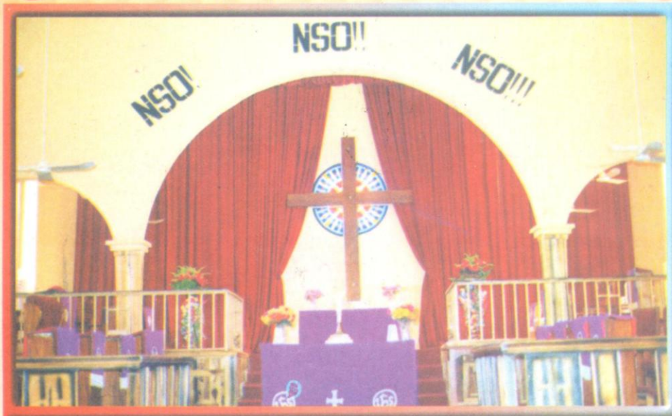
Chancel decorated by the women