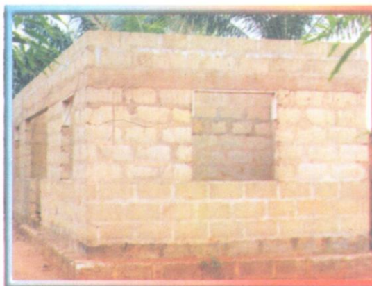
Women bungalow building project in progress.