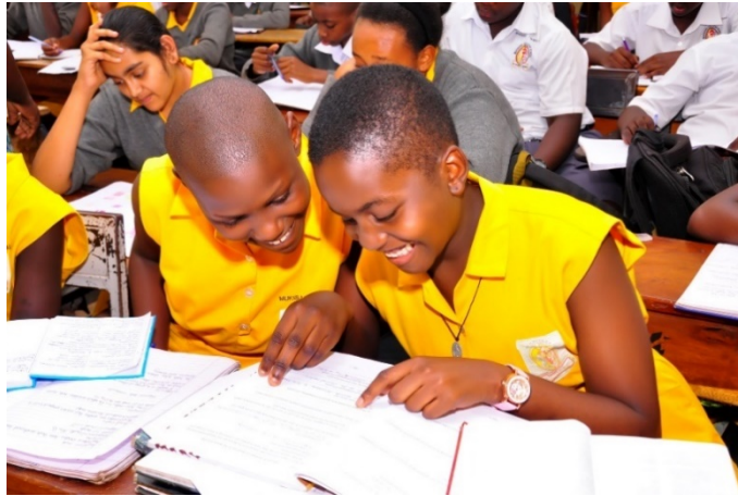
Secondary school girls in Uganda comparing notes during class.