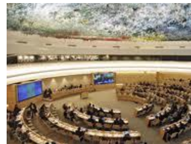
UN Human Rights Council, Geneva

During the Council the UN General Secretary, M. Ban Ki-Moon, stated that "women, men and children in every country, who were confronted with grave crimes committed amidst conflict or were victims of day-to-day discrimination, had the right to expect the international community to be on their side and that it was ready to react."