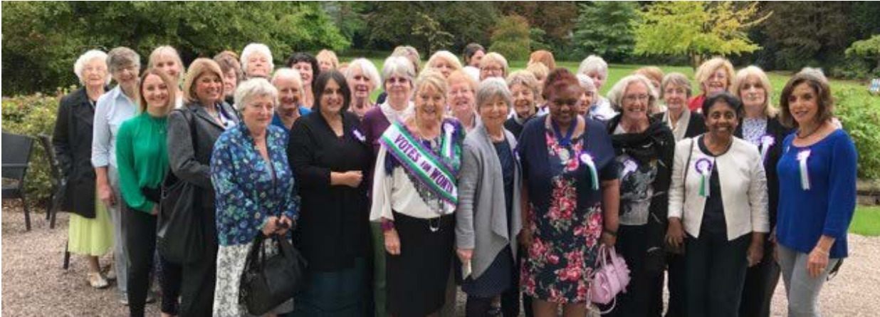
GWI members from Ireland, Scotland, Wales and England met on 22 September in Manchester for the first English Speaking European Meeting hosted by the British Federation of Women Graduates (BFWG)