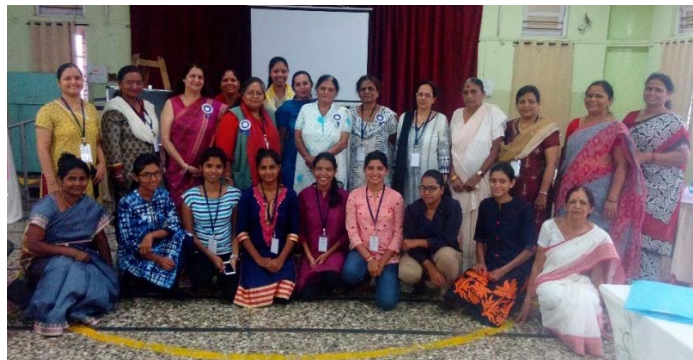
Project Proposal Group

The 2016 Indian Federation of University Women's Associations (IFUWA) Bina Roy Partners in Development (BRPID) project: Women's Economic Empowerment Education and Income-Generation Projects brought together 115 participants between June and November 2016. During phase one of the project these attendees from IFUWA Delhi, Pune and Madras took part in skills-development training such block printing, food products preservation like jams and squash making; sweets and savorys; and pickle making; plus, arts and crafts. The project also offered support services training such as personal development and leadership skills, financial literacy, spoken English and computer basics. The second phase of the project operated until August 2017 by UWA Delhi included skill-development training of handicraft items using rope and other waste materials in rural areas. During the final and implementation phase, women's groups were developed and the projects field tested; with an emphasis on maximizing the direct impact of grassroots management training activities.